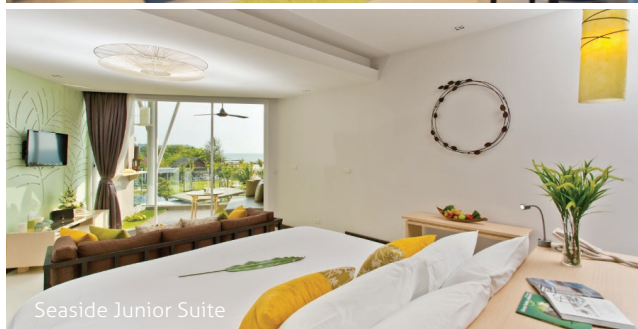
Seaside Junior Suite