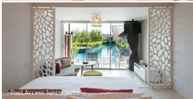
Pool Access Junior Suite