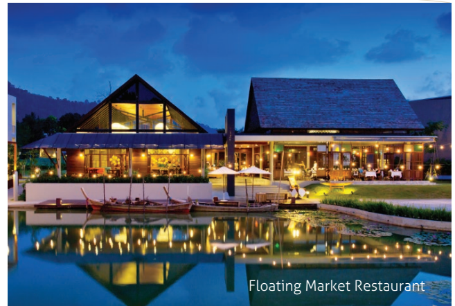
Floating Market Restaurant

Coconut Bar With swim-up pool bar set just steps away from the ocean, allowing guests to enjoy exotic drinks while cooling down in the pool!